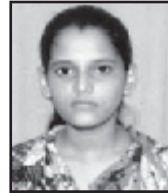
Pande Aditi Agg. - 84% B.K. - 99